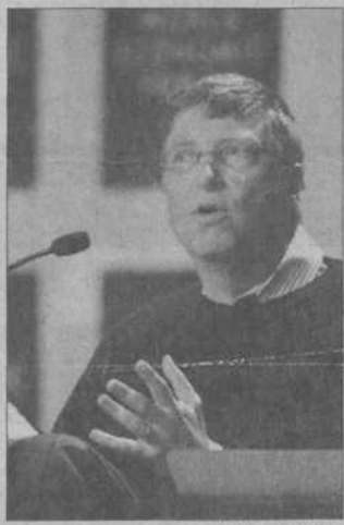
Microsoft Chairman Bill Gates gestures while speaking during the 'G8-Africa' plenary session at the World Economic Forum in Davos, Switzerland on Thursday.

"Millions of children die in Africa who shouldn't die, who it would be very easy to save," he said. "The fact that we don't apply the resources to the known cures or to finding better cures is really ... the most scandalous issue of our time."