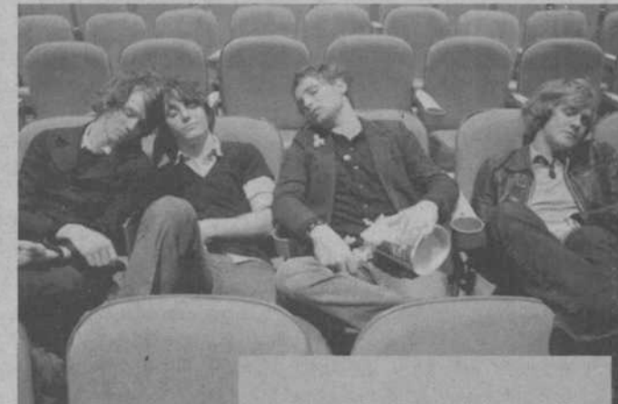
With I-9 at Jammin' Java, 9 p.m., $5