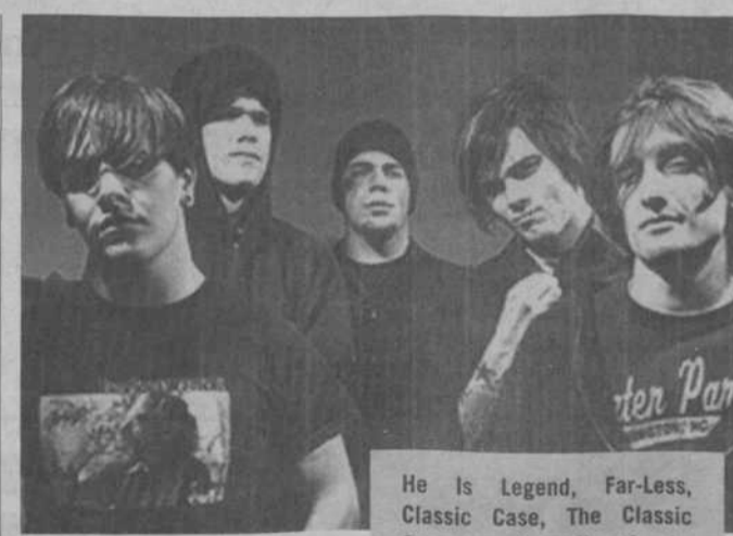
He is Legend, Far-Less, Classic Case, The Classic Struggle, Council of the Fallen: 6 p.m. New Brookland Tavern, 122 State St. $10 in advance. All ages.

The Reverie, Flyby: 8 p.m. New Brookland Tavern. $5, 21+, $7, under 21. "What the #$*! Do We Know!": 7, 9:15 p.m. Nickelodeon Theatre. "The Rocky Horror Show": 7:30 p.m. Trustus Theatre. Bobby Houck of Blue Dogs with Jim "Soni" Sonefeld of Hootie & the Blowfish: 9 p.m. Jammin' Java,