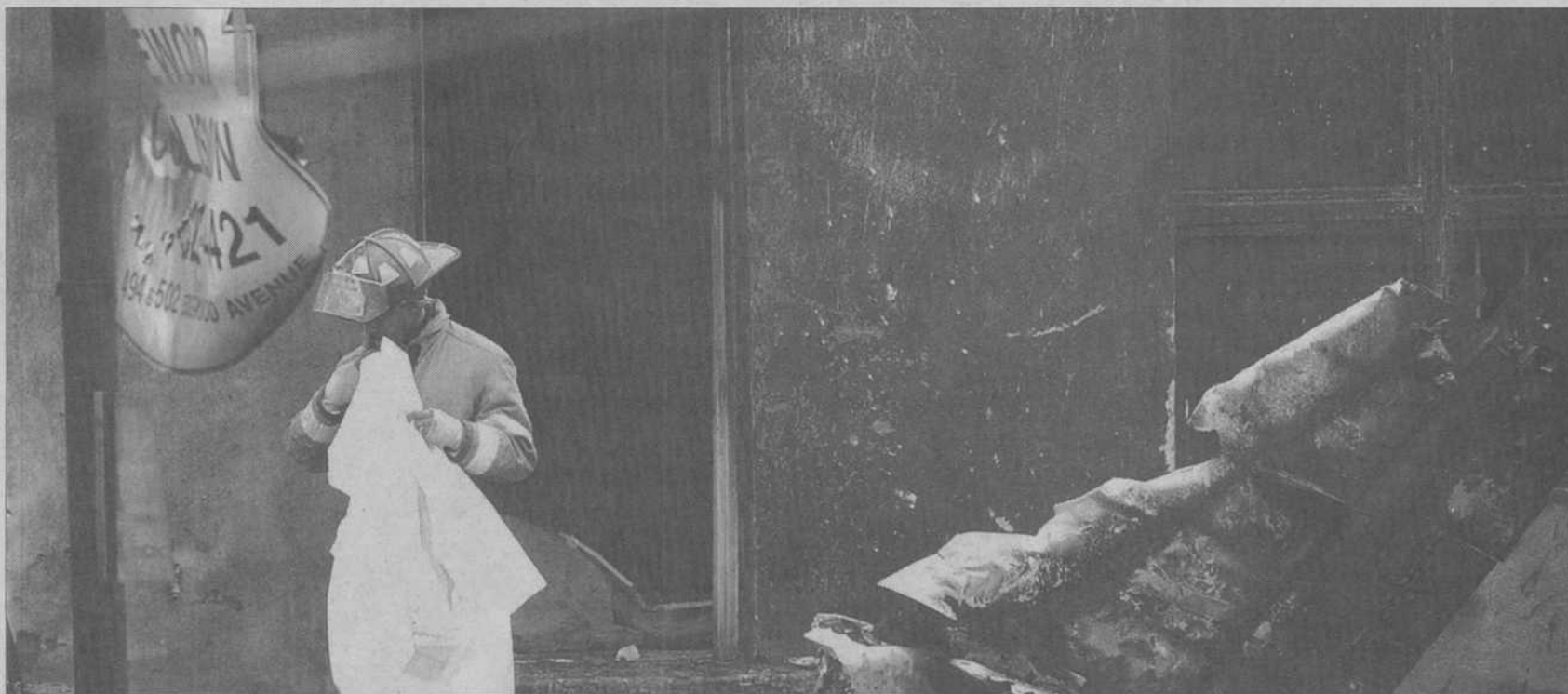
An Atlanta firefighter walks with a tarp through the wreckage of a small plane that crashed in Atlanta Tuesday. The plane with two people aboard crashed during a rainstorm into an auto-body shop.

The neighborhood, which calls itself the cradle of the civil rights movement, includes old warehouses that have been converted into apartments and businesses.