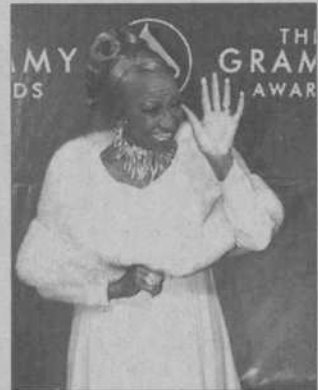
Salsa queen Celia Cruz arrives at the Grammy Awards in New York last year.

Documents obtained by The Miami Herald for a story Thursday show she was finally granted permission to stay permanently in