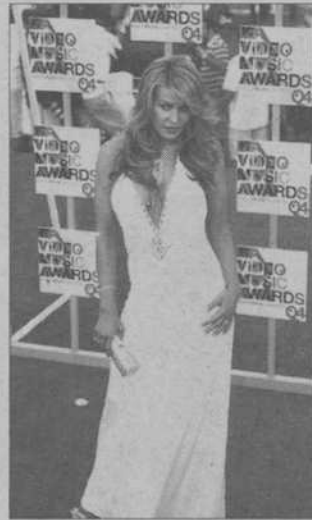
Carmen Electra arrives for the MTV Video Music Awards in Miami on Sunday.

judges Bruce Hulse and Marisa Miller, both professional models themselves. For eight episodes, 15 men will compete in a series of challenges in hopes of snapping up a one-year contract with the IMG modeling agency.