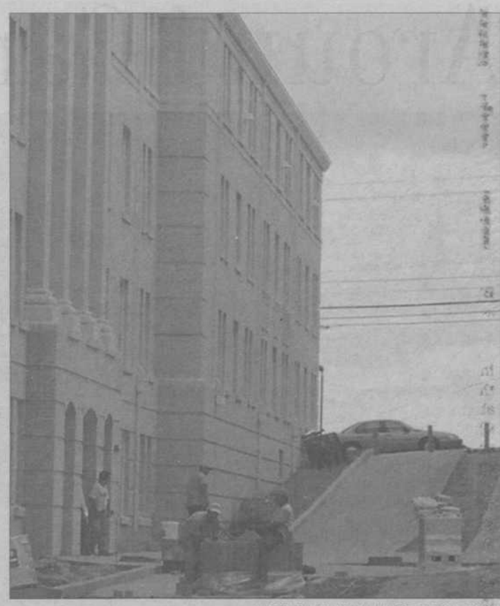
Workers wrap up construction in front of Building C.