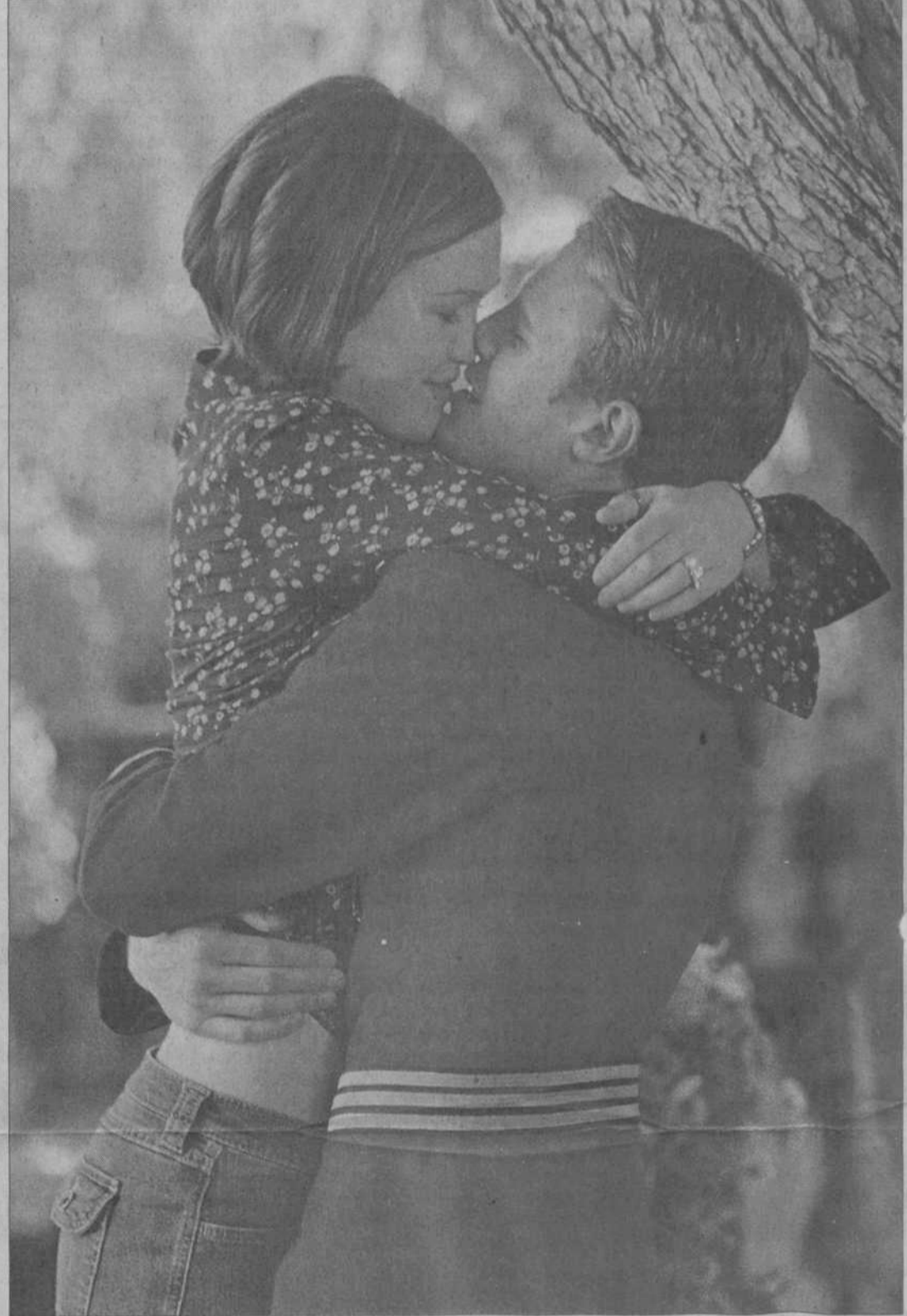
Julia Stiles stars alongside Luke Mably in "The Prince & Me" from Paramount Pictures.

"If we went and made another matchbox album, it would be pretty stale right now."