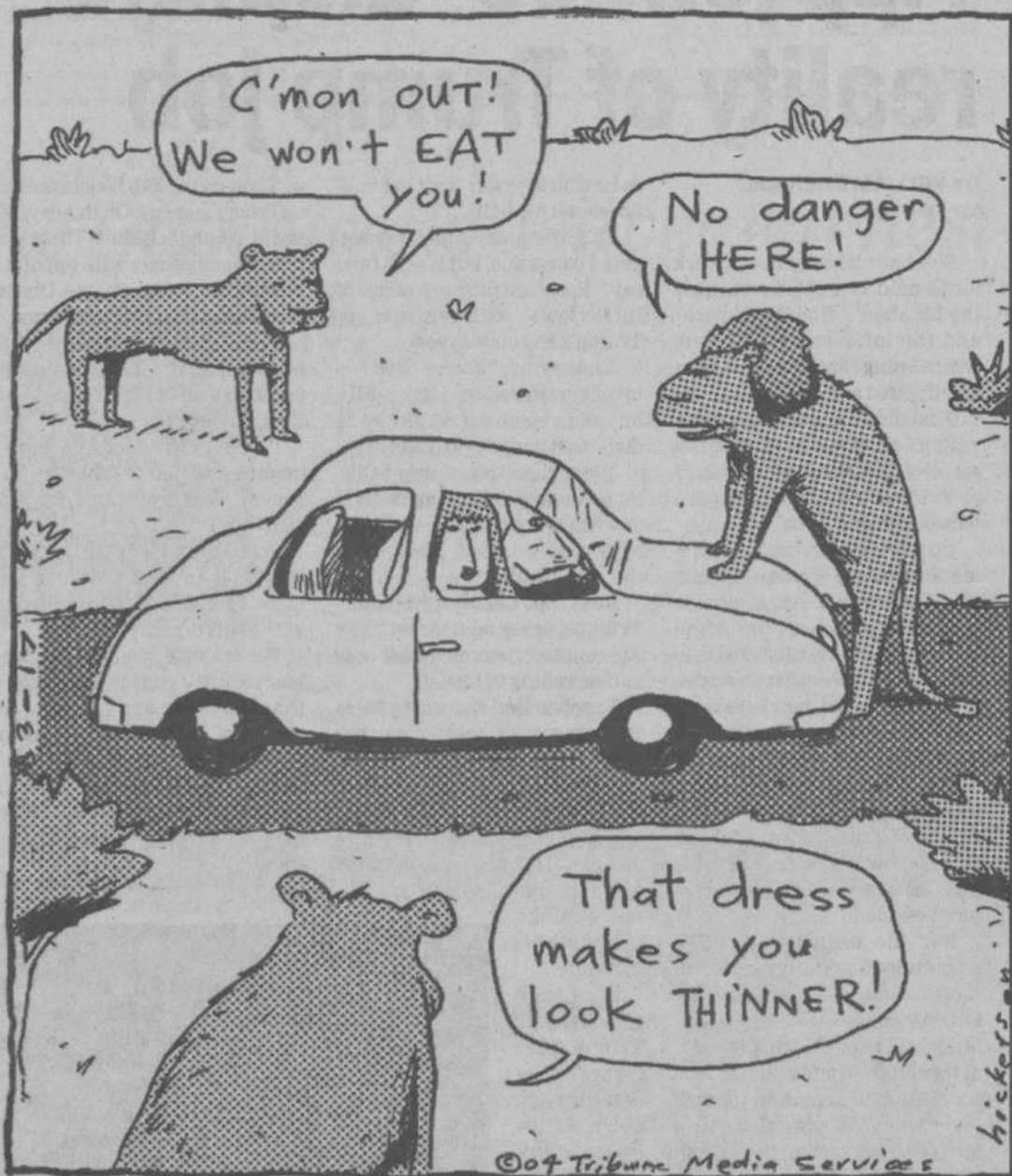
The Quigmans visit Lyin' Country Safari.