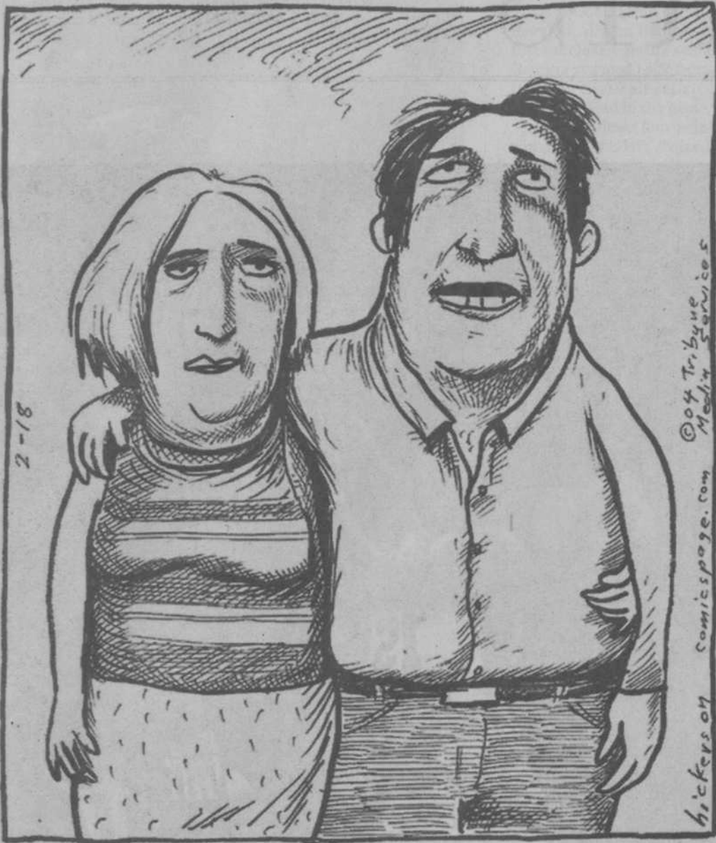
"The secret of our lasting marriage can be found in Sun Tzu's 'The Art of War': 'Keep your friends close and your enemies closer.'"