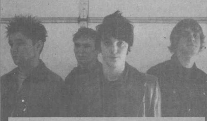
Tinker's Punishment and The Letter Red. Saturday at 9 p.m. New Brookland Tavern. $5 21 and up, $7 under 21.