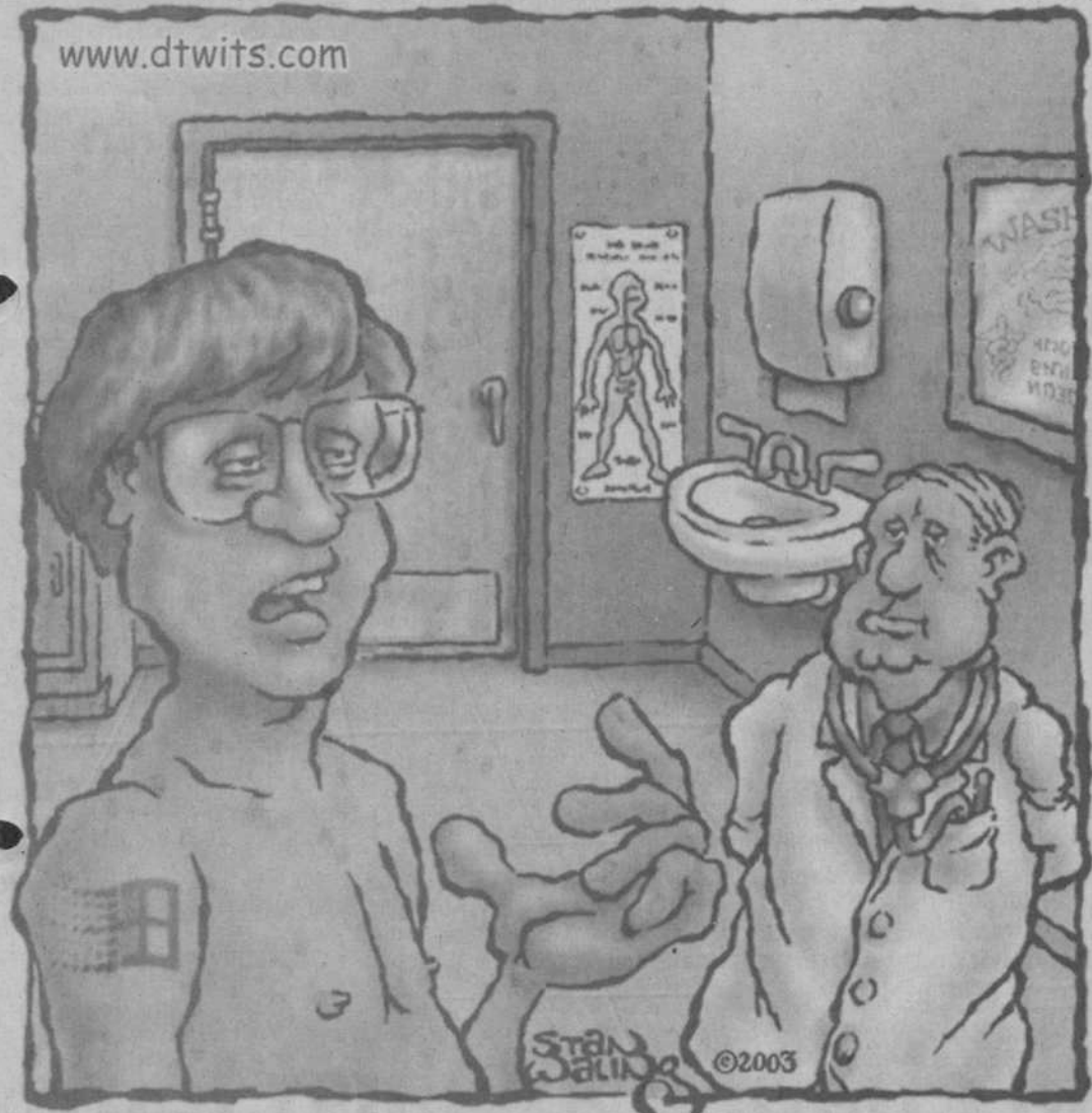
"I don't know, Doc. I just feel like a million bucks."