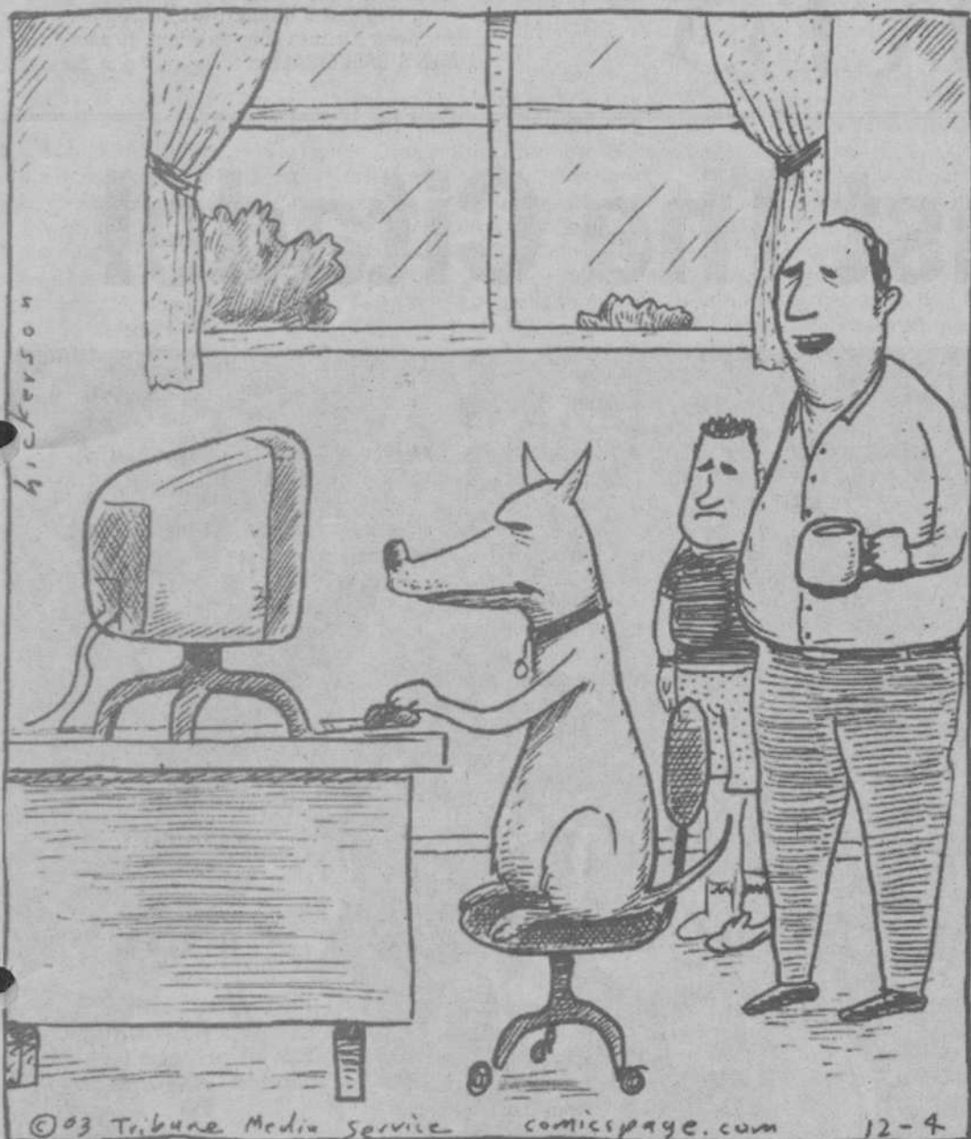
"Check out Scruffy's new trick, son ... I taught him to retrieve a file."