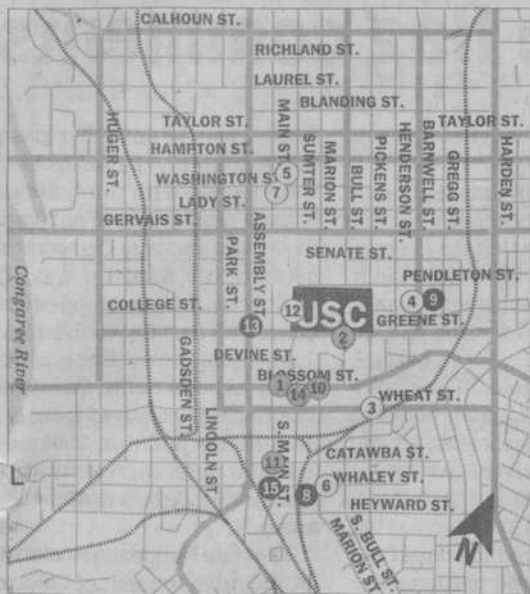
These reports are taken directly from the USC Police Department.

Each number on the map stands for a crime corresponding with numbered descriptions in the list below.