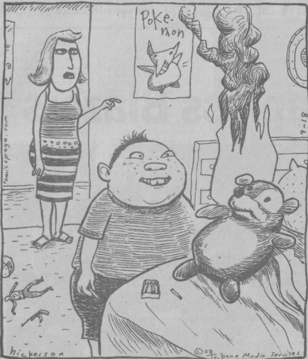
"No, Billy ... The saying is: 'If you love something, set it free,' not on FIRE."