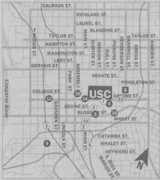
These reports are taken directly from the USC Police Department. Compiled by Adam Beam.

Each number on the map stands for a crime corresponding with numbered descriptions in the list below.