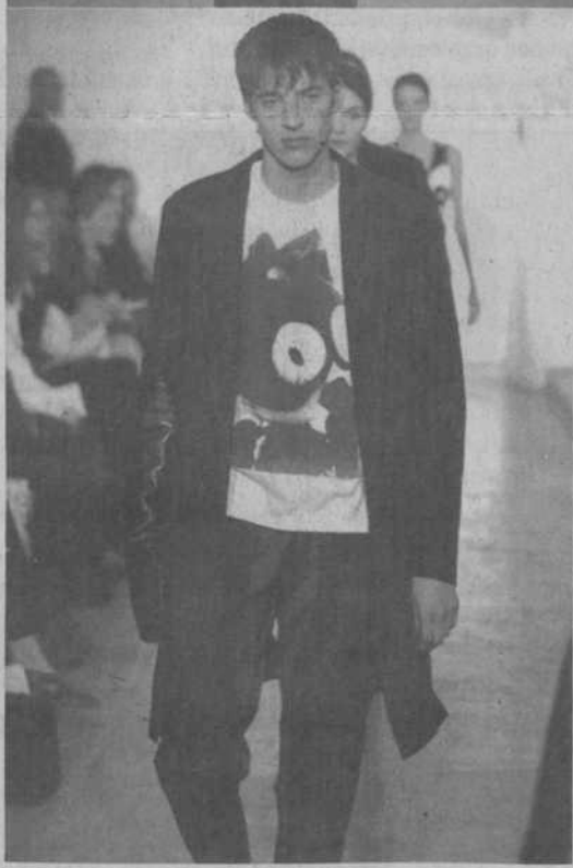
Select styles from the Helmut Lang Spring 2003 Collection typify some of the current trends in style, such as flowing dresses, miniskirts and decorated jackets. The fashion elite have produced eclectic collections, bringing social awareness and an emphasis on creativity.