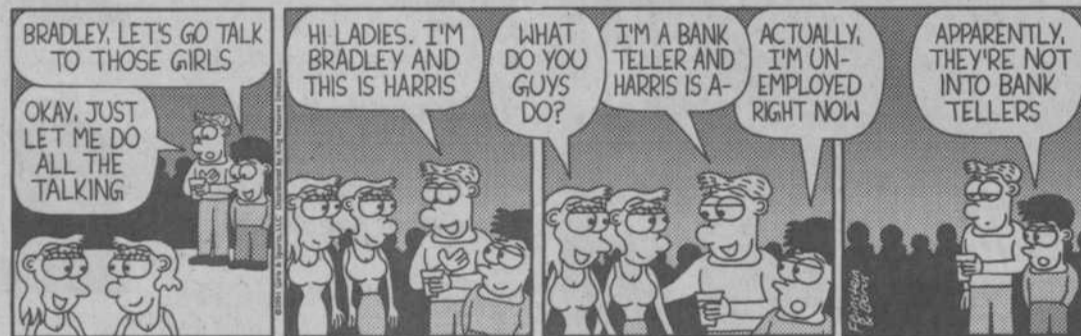
Girls & Sports appears every Wednesday in Gamecock Sports.