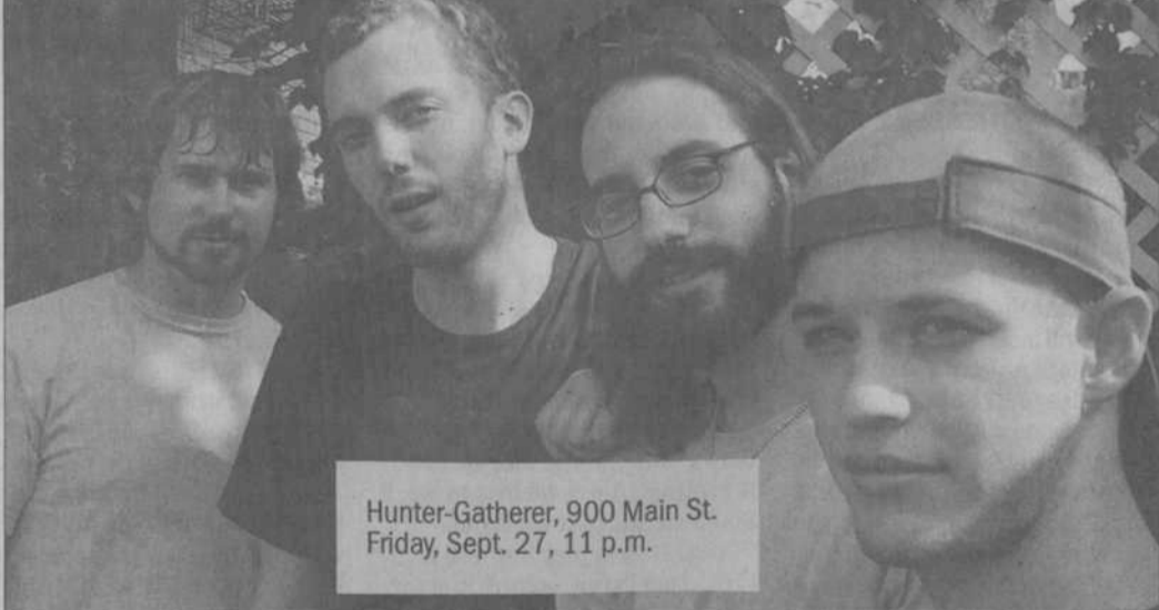
Hunter-Gatherer, 900 Main St. Friday, Sept. 27, 11 p.m.