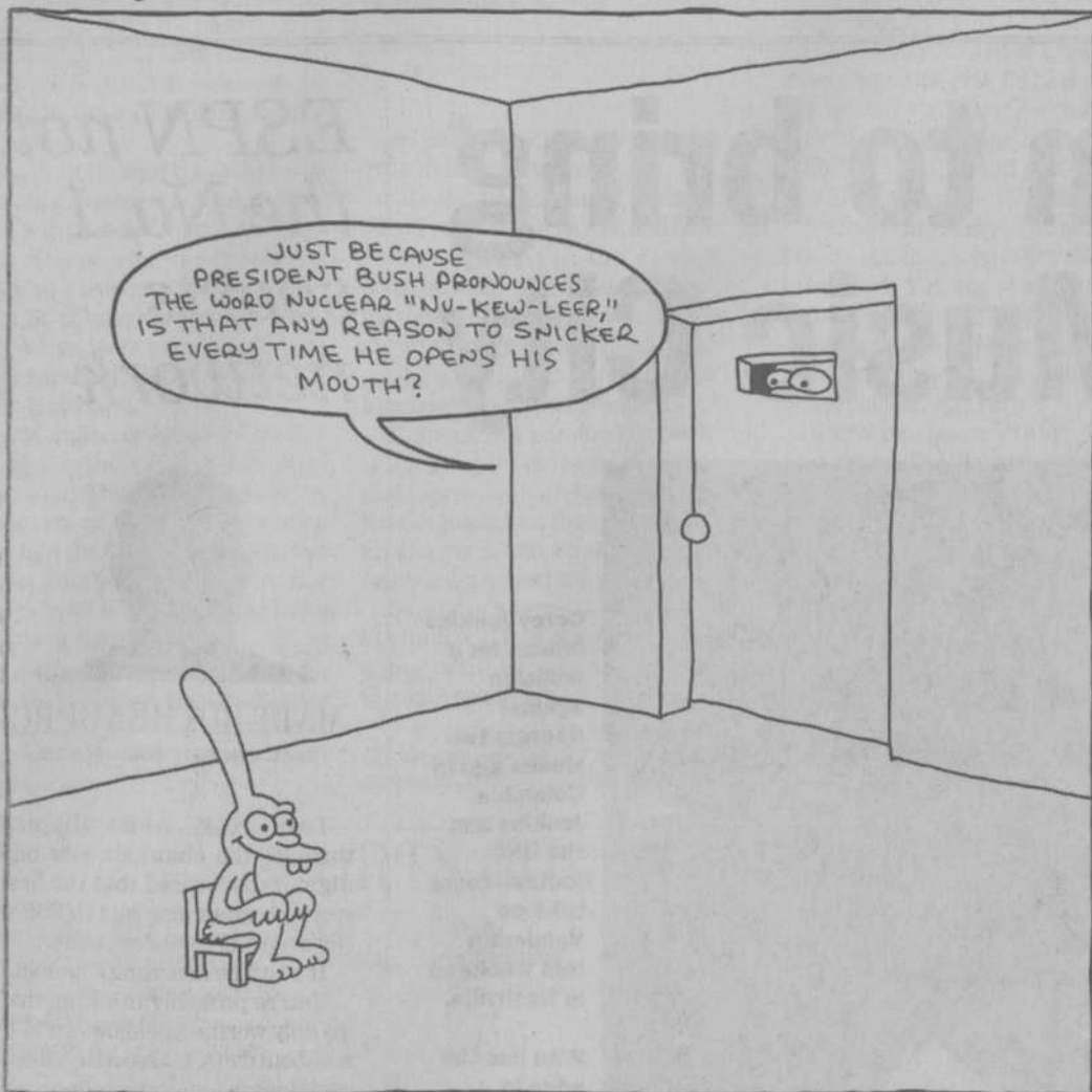
9-27-2002 KENE FEATURING SUPERHERO ©2002 BY MATT GROENING