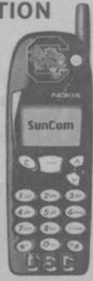
NOKIA 5165 SunCom Ready

FREE NOKIA 5165 DIGITAL PHONE iNotes™ 2-way Text Messaging for 3 months University of South Carolina Face Plate ACTIVATION