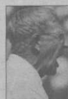
USC head coach Lou Holtz was pleased following his team's scrimmage this past weekend.