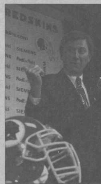
Steve Spurrier talks at his news conference Thursday.

Snyder said he didn't have a beef with Schottenheimer as a coach. Instead, the two parted