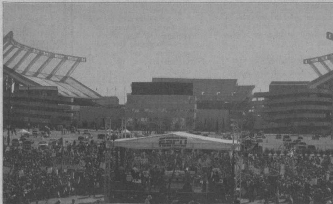
Below: More than 10,000 fans gathered at the State Fairgrounds on Saturday morning for the live broadcast of ESPN's College GameDay.