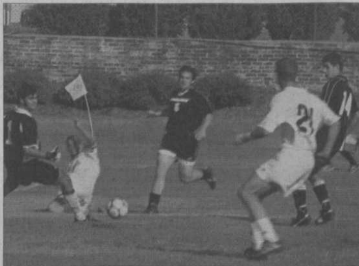
The Gamecock offense prevailed over Drury's tight defense last week.