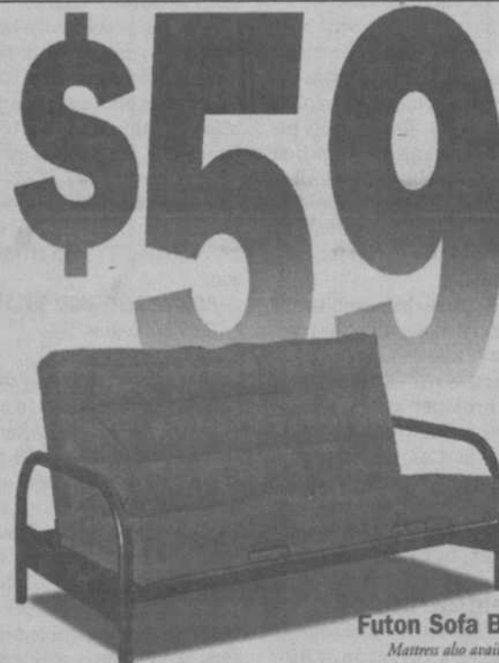
Futon Sofa Bed Mattress also available.

Presenting dorm furniture that leaves you money for tuition.