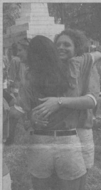
Kappa Deltas prepare to welcome the women they hope will be their new pledge class, top.

Because the large number of girls caused "a few difficulties"