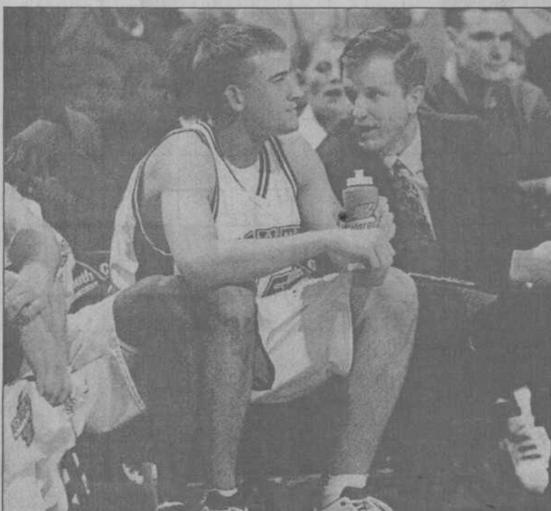
Special to The Gamecock