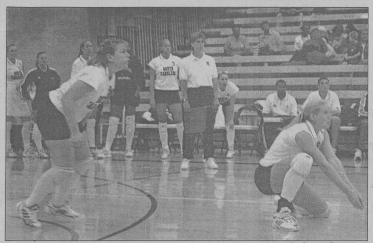
Two USC volleyball players prepare to receive a spike against Mississippi State. The Gamecocks will try to continue their winning season this weekend when they travel to Gainesville for the SEC Tournament.