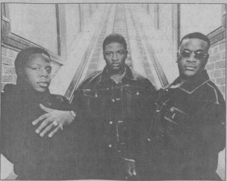
SPECIAL TO THE GAMECOCK