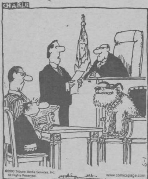
"Your Honor, a principal in this violation of the pooper-scooper law wishes to turn state's evidence."