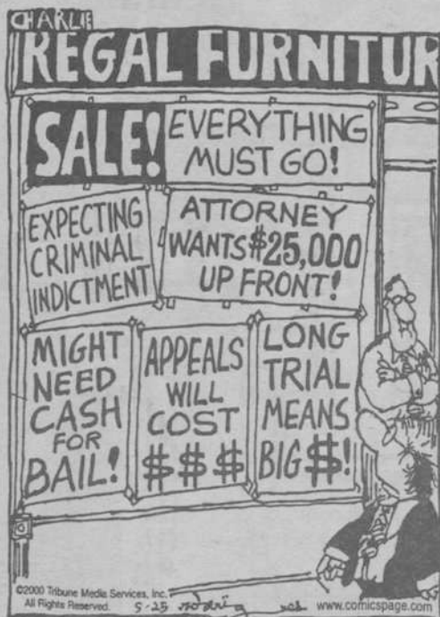
©2000 Tribune Media Services, Inc. All Rights Reserved. www.comicspage.com