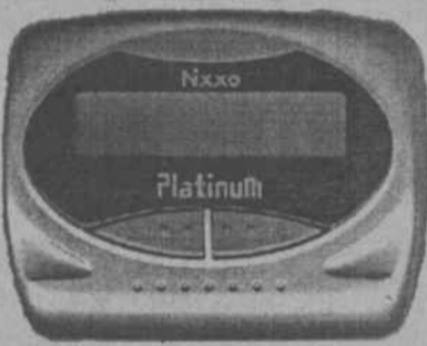
(SHOWN AS ACTUAL SIZE)

Activation & First Month Service Required