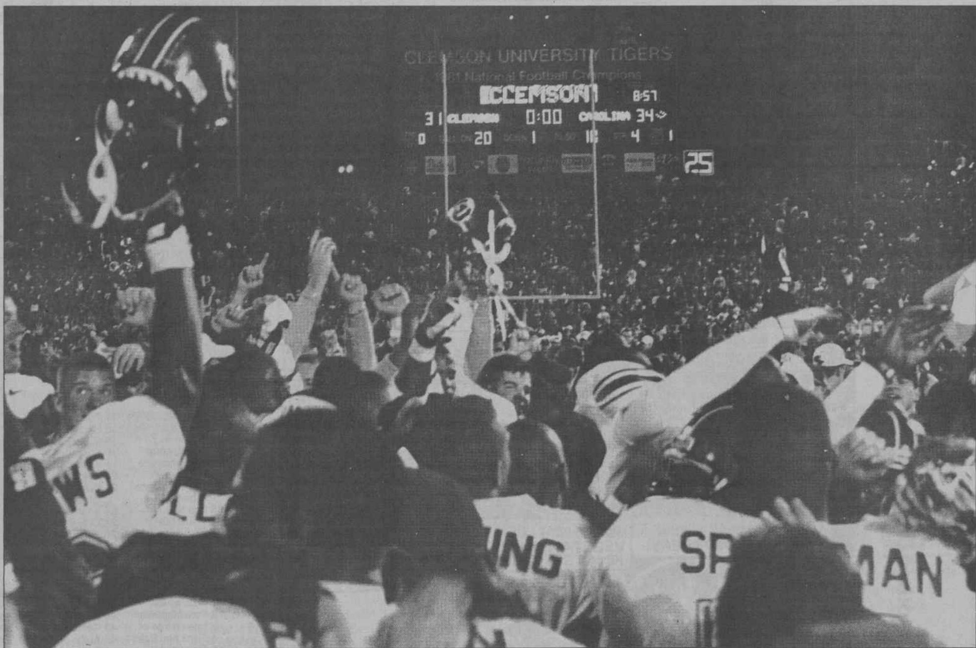
Carolina players and fans celebrate the 34-31 victory over the Tigers two years ago in Death Valley. The visiting team has won the last seven games in this rivalry.