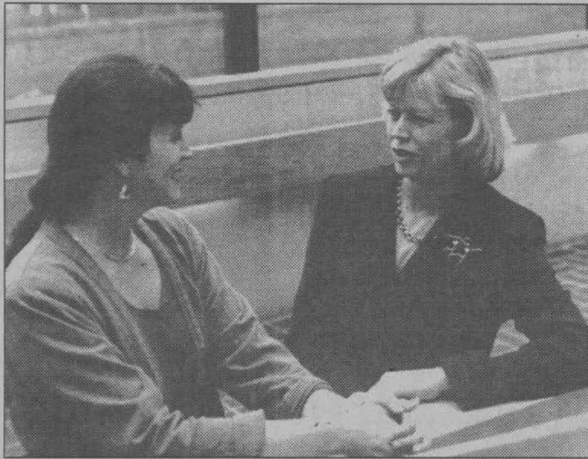
Special to The Gamecock

"But I think it is important to teach with passion -- passion about your subject --