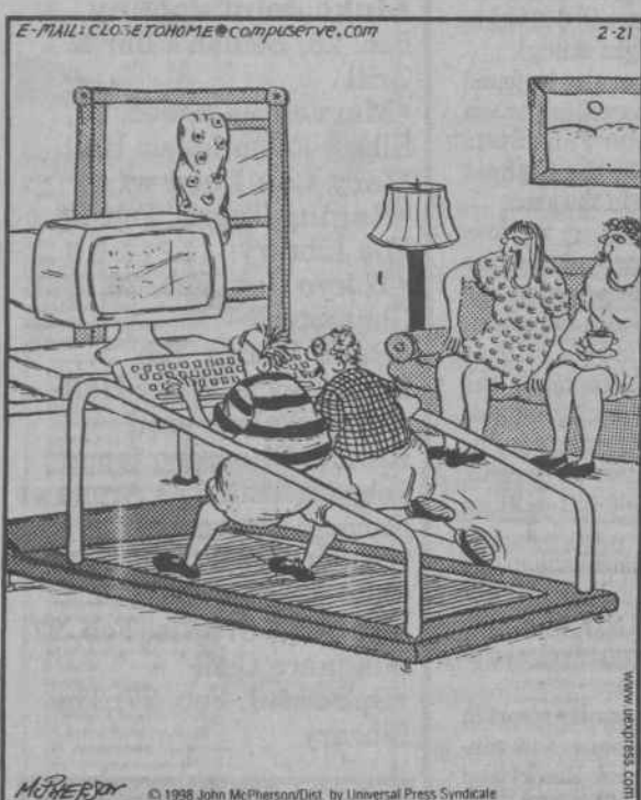
"Yep, that's the new rule. If they're going to spend all their free time surfing the Net, the treadmill's got to be on."