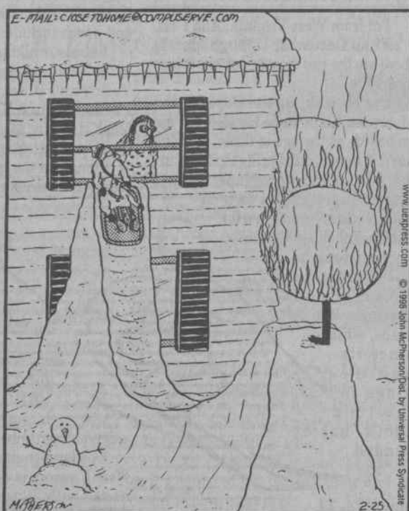
"Aw, come on, Mom. We worked on it all afternoon."