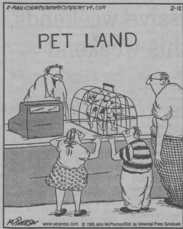
"For an additional $150, would you like our one-year stain-removal service plan?"