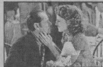
SPECIAL TO THE GAMECOCK

"The Full Monty" captured three nominations including Best Picture.