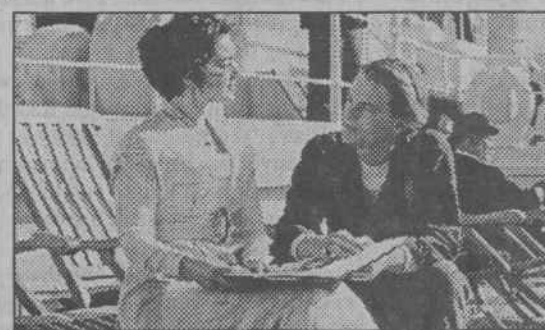
SPECIAL TO THE GAMECOCK

► BEST PICTURE: "As Good As It Gets," "The Full Monty," "Good Will Hunting," "L.A. Confidential" and "Titanic."