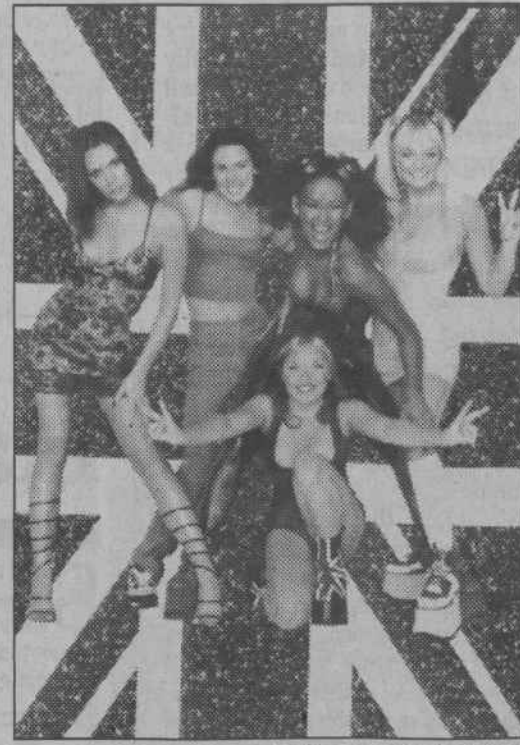
SPECIAL TO THE GAMECOCK

Do not attend Spice World and expect to find enlightenment. This movie is obnoxious, but that is what makes it so great. The first half hour is painful-