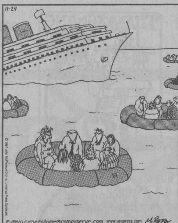
"Yeah, well, where's Kathie Lee now?!"