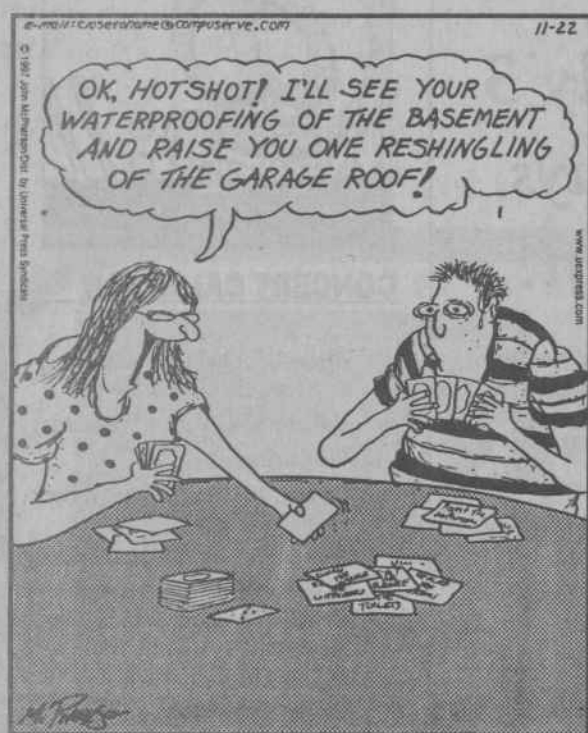
The Gilmonts play a tension-filled game of chore poker.