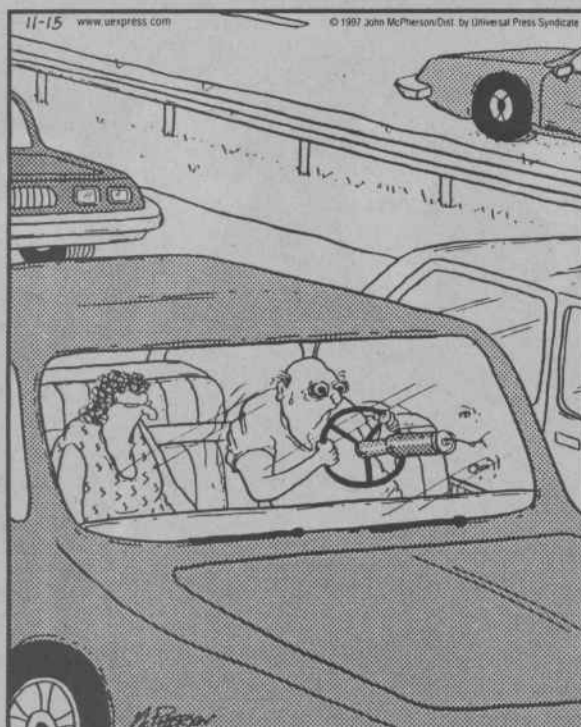
"Well, now! Maybe the next time I tell you that the car is making a funny rattling noise, I won't get one of your condescending smirks!"