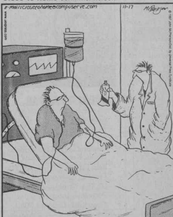
"There are two divergent opinions on how best to treat you. I'm convinced you need a triple bypass. Your HMO says all you need to do is rub this $14 tube of salve on your chest."