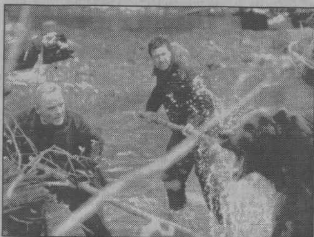
SPECIAL TO THE GAMECOCK

The Edge , an action-adventure film starring Anthony Hopkins and Alec Baldwin, is placed somewhere in the cold wilderness of the Earth.