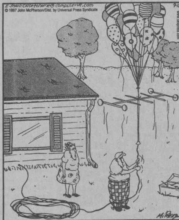
"OK, free HBO! Come to papa!"