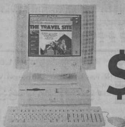
Power Macintosh ® 4400/200 Small Business 32/2GB/12XCD/Multiple Scan 15AV/L2 33.6 Modem/Microsoft Office/Kbd Now $2,050** BEFORE REBATE

*This is a limited time rebate coupon offer. See your Apple campus reseller today for complete details.