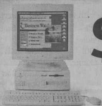
Power Macintosh ® 7300/200 32/2GB/12XCD/Multiple Scan 15AV(not as pictured) L2/Ethernet/Kbd Now $2,620** BEFORE REBATE