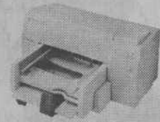
Color StyleWriter ® 4500 Now $315** BEFORE REBATE