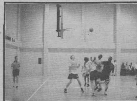
Intramural basketball playoff action.

* Denotes team entry fee. $15 per team @ Denotes separate fee. To be determined later. Schedule subject to change.