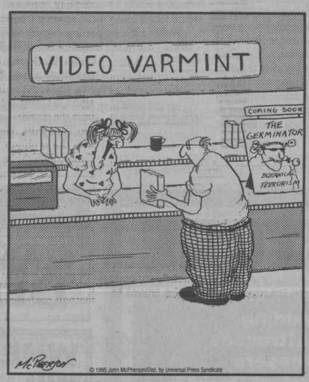
"The video is due back at 7 p.m. tomorrow. After that it will begin to emit a hideous stench. Enjoy the movie!"