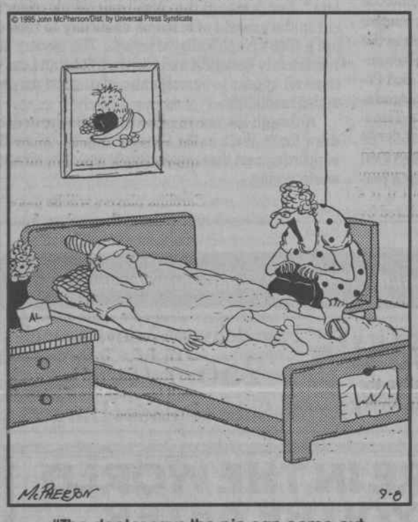
"The doctor says the pin can come out in three months."