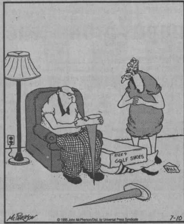
"The salesman said that these provide three times the traction of regular golf shoes!"