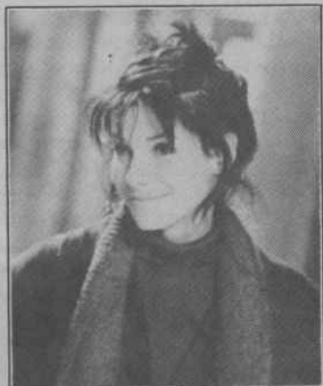
Hollywood Pictures CPU will show a free sneak preview of 'While You Were Sleeping' starring Sandra Bullock at 6 p.m.

"A Journey to Hindoostan: Romantic Views of India, 1780-1860" is on