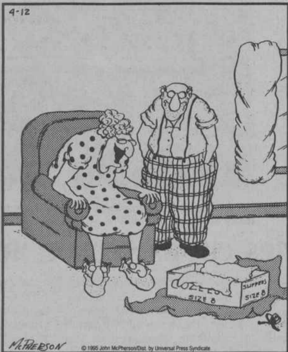
"They're perfect, Charles! I'll think of you every time I wear them."