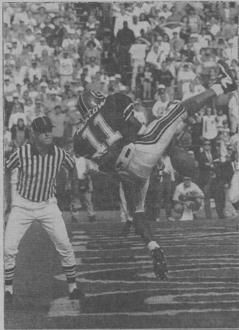
VAN HOPE The Gamecock

"That's just one play that we needed to come up with. We shouldn't have