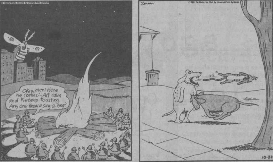
The Army's last-ditch effort to destroy Mothra.