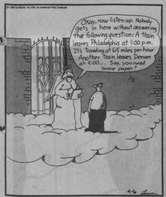
Math phobic's nightmare