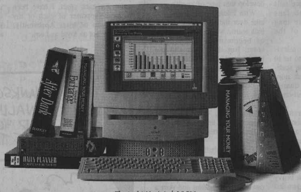
The Apple® Macintosh LC 520 now comes with seven incredibly useful programs. What a package.

Now, when you choose a qualifying Macintosh® or PowerBook® computer, you'll not only get Apple's new, lower prices. You'll also get seven popular software programs included for the same low price. These programs will help you manage your finances, schedule your time and entertain your friends (the software alone has