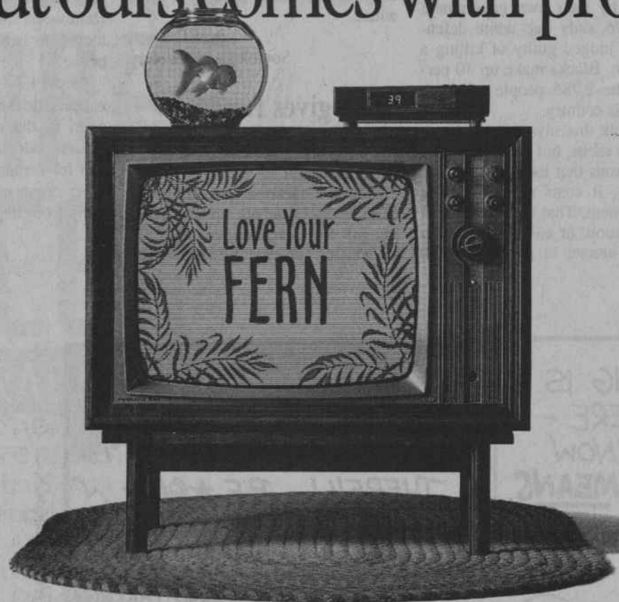
Cable TV. 65 channels of reruns, game shows and soap operas.

Both of these cost about $30 a month, but ours comes with programs you can actually use.