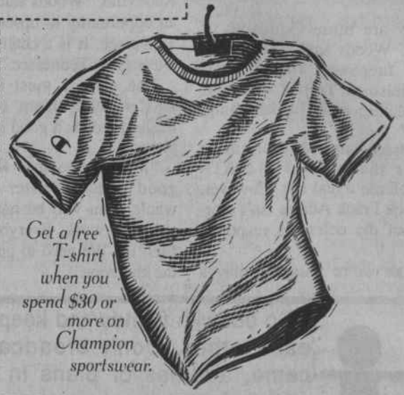
Get a free T-shirt when you spend $30 or more on Champion sportswear.

Attention, students in Engineering: (\sqrt{x})^2 - (x/\sqrt[3]{125}) = y , where x = original Champion price and y = revised cost, Oct. 25-30.