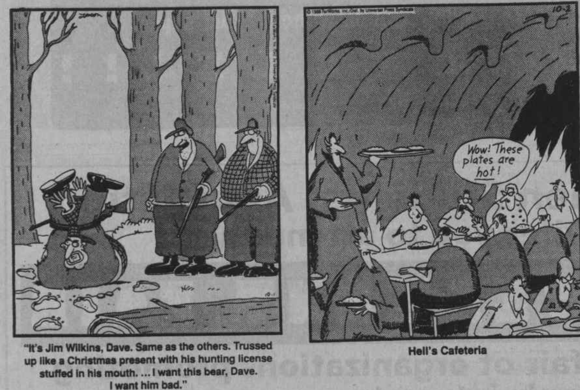
"It's Jim Wilkins, Dave. Same as the others. Trussed up like a Christmas present with his hunting license stuffed in his mouth. ... I want this bear, Dave. I want him bad."